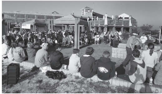
Over 400 volunteers gathered at the Seagull's Nest on Sandy Hook

October 20th was a beautiful and sunny fall day for over 1500 volunteers to clean New Jersey's beaches and waterways for Clean Ocean Action's 27th Annual Fall Beach