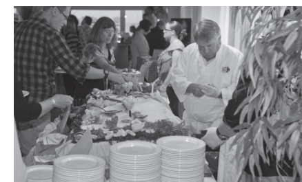
Raw Bar by Lusty Lobster