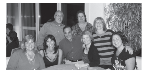
Entertainment Sponsor Plymouth Rock Assurance