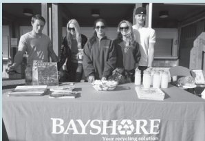
Montecalvo Material Recovery Facility representatives at Fall Beach Sweeps Sandy Hook site.

BRC's environment stewardship and leadership goes well beyond the beaches. They have received national and regional awards in recycling as well as from all sectors of the community. Their state of the art facility in Keasby, NJ, is powered in part by nearly 9,500 solar panels (680 kilowatts) — one of the largest photovoltaic system in the recycling industry. BRC's corporate vision is to operate 100% green businesses powered by 100% renewable energy, as well as to support local, regional, and national organizations.