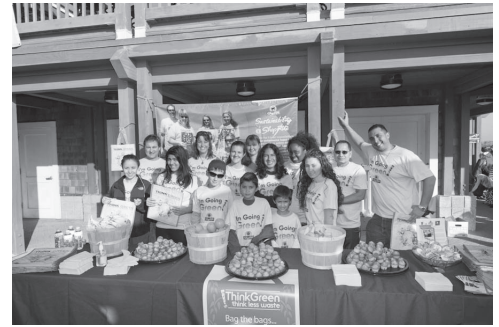
Shoprite "goes green" for Beach Sweeps

October 20th was a beautiful and sunny fall day for over 1500 volunteers to clean New Jersey's beaches and waterways for Clean Ocean Action's 27th Annual Fall Beach