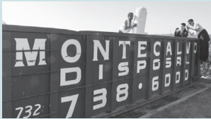
Montecalvo Material Recovery Facility dumpster at the Sandy Hook Beach Sweeps site.