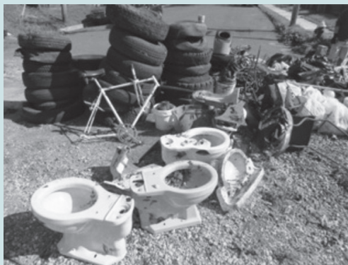
Illegally dumped tires and toilets found in Red Bank