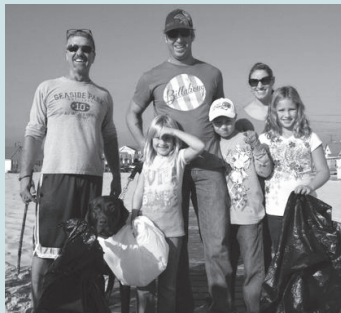
Seaside Park Volunteers at 6th Lane Midway Beach

Atlantic City • House of Blues donated free tickets to Saturday's performance of surf rock/reggae band from Southern California, Slightly Stoopid, to the top ten participants who collected the most trash during the Beach Sweeps in Atlantic City.