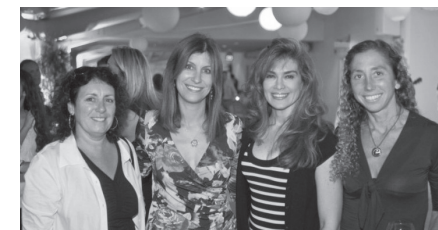
Team Pirate Booty

Call COA at 732-872-0111 for information on upcoming events or volunteering on one of the fun planning committees for our fundraisers. For more events photos, visit our Facebook page.