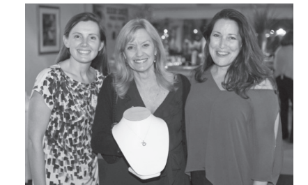
Glass Wave Necklace Donated by Weston Gallery