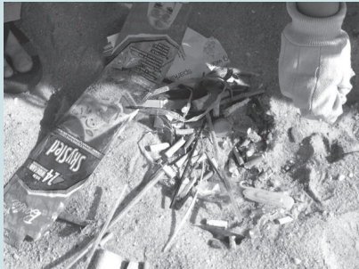
Trash collected at Point Pleasant Beach

Special thanks to COA's dedicated Beach Captains , generous sponsors (see list on left), Gateway National Recreation Area - Sandy Hook Unit , Island Beach State Park , Monmouth County Park System , Marine Academy of Science and Technology (MAST) , numerous municipalities , and all volunteers , especially Barbara Bennett .