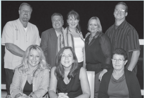
Montecalvo Material Recovery Facility sponsored COA's 14th Annual Seaside Sunset event.

The Montecalvo Family of Companies are making a splash turning waste into wares. Their outstanding leadership is establishing recycling as a premier business model and creating a sustainable industrial complex. They are also champions of Clean Ocean Action, contributing in many ways. Montecalvo Recovery Facility and Bayshore Recycling Corporation (BRC) have been generously supporting COA since 2004 through sponsoring beach sweeps and events, hosting friend-raisers at their home and on their yacht, and volunteering on committees. They also have donated a container for Beach Sweeps at Sandy Hook making it possible to recycle nearly 70% of the litter.