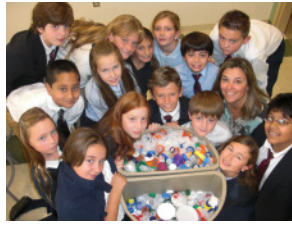
Students from Ranny School display their caps collection