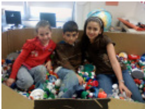
Students from Mullica Middle School dive into "cap action"

Teachers' Insurance Plan of NJ Special rates for a special class of people