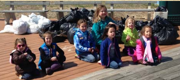
Volunteers at Ocean Grove with bags of trash collected.

* not part of the Dirty Dozen for indicated year