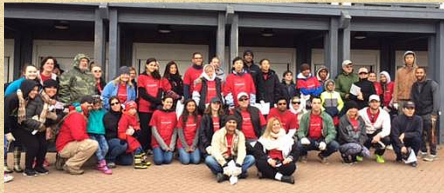
Bank of America Volunteers at Sandy Hook

Colleges and Universities: Atlantic Cape May Community College, Brookdale Community College, Georgian Court University, Kean University, Middlesex County College, Monmouth University, Northeastern University, Ocean County College, Raritan Valley Community College, Rider University, Rutgers University, Seton Hall University, and Stockton University.