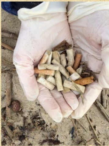
Snug Harbor site in Highlands

Cub Scout Packs: 158, 209 Boy Scout Troops: 162, 163, 219, 228, 241, 634