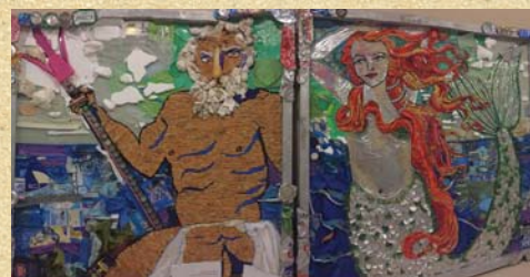
(LEFT) Attendees at conference (MIDDLE) Student attendees with the 'Bottle Cap Curtain' at the Debris Free Sea Conference (RIGHT) Community mosaic created by Stella Ryan on display