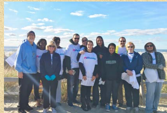
(RIGHT) Volunteers at Sandy Hook Beach