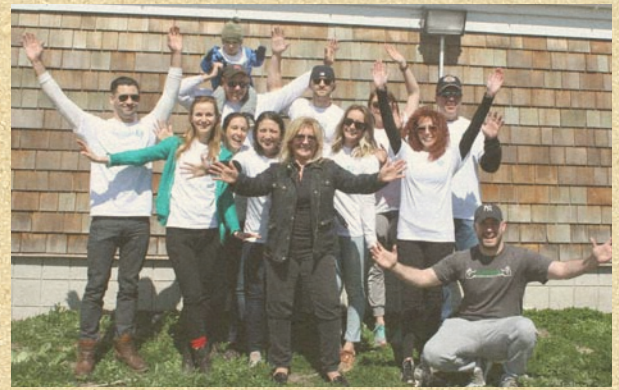
Volunteers from Montecalvo Material Recovery at Sandy Hook

Elementary Schools: Bradley Beach, Deal, Deane Porter, Forrestdale, Herbertsville, Holy Cross, Lavallette, Monmouth Beach, Neshaminy, Oak Knoll, Ocean Avenue, Ocean Gate, Our Lady of Peace, St. Dominic, St. Joseph, St. Roberts Freehold, Washington Street, West Belmar, Whitehall, and Wildwood.