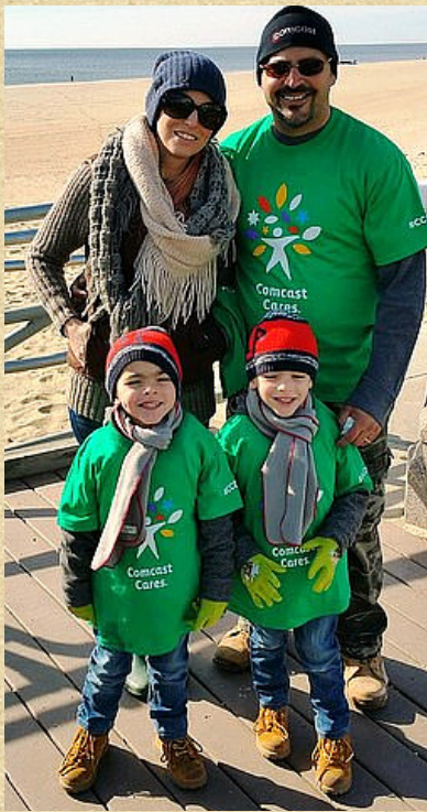
Comcast Volunteers in Long Branch