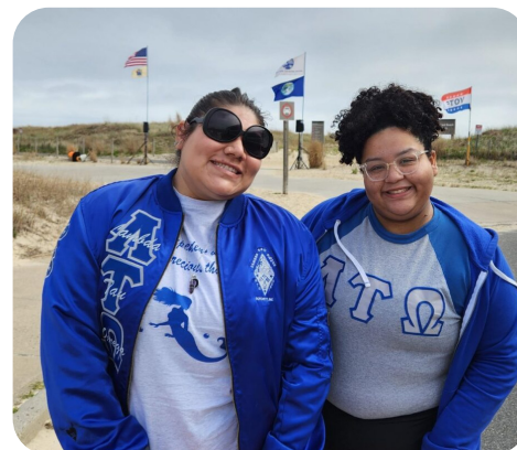
Alpha Tau Omega Sorority Sisters