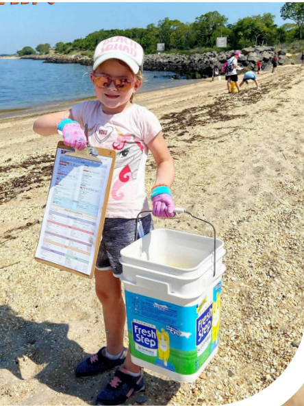
Fun for all ages!

A day of service, a lifetime of evidence to make the ocean cleaner!