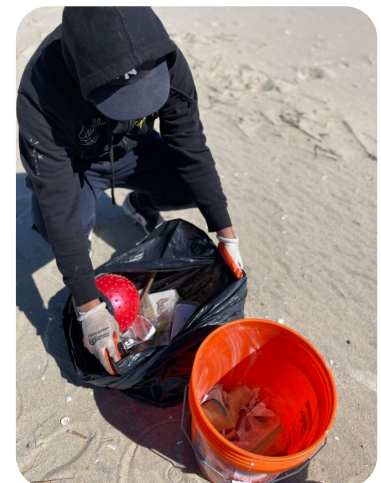
Spring Lake Volunteer Sorts Debris