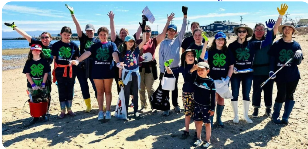
Atlantic Highlands 4H Kindness Club

Special thanks to our Ocean Wavemakers, who contributed time effort, resources, and donations!