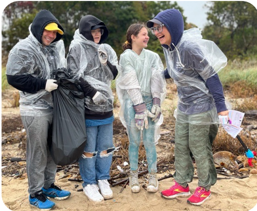
Family at Sandy Hook during Fall Sweeps

Memorial High School, Key Club (Monroe Twp. HS), Lacey Township High School, Long Branch High School (Softball Team), Lower Cape May Regional High School, Manalapan High School, Manalapan High School (LEPS Magnet Program), Manasquan High School, Marine Academy of Science & Technology, Marine Academy of Technology and Environmental Science, Marlboro High School, Matawan Regional High School, Metuchen High School, Middletown High School (North), Middletown High School (South), Middletown High School North (Environmental Club), Monmouth Regional High School, Monroe Township High School, Monsignor Donovan High School, New Egypt High School, Newark Academy, Ocean City High School (Environmental Club), Ocean City High School (Key Club), Ocean Township High School, Old Bridge High School, Palmyra High School, Pennington School, Ranney School, Red Bank Catholic, Red Bank Regional High School, Rumson Fair Haven Regional High School, Saint John Vianney, Somerville High School (National Honor Society), South Plainfield High School, Southern Regional High School, St. John Vianney, St. Mary's, St. Rose Catholic High School, Toms River High School North, Trinity Hall, Wall High School, Wildwood High School, Williamstown High School, Winslow Township (Environmental Club)