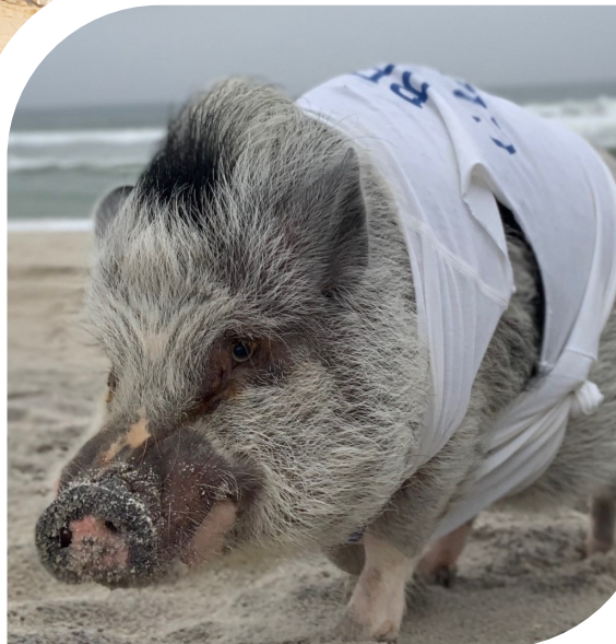
Famous Hamlette in Ortley Beach