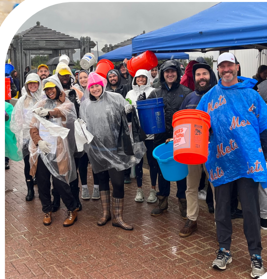
Reduce plastics: Bring Your Own Bucket