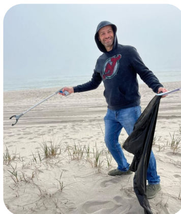
Friendly Reminder: Stay Off the Dunes!

Academy of The Holy Angels, Barnegat High School, Biotech High School, Brick Memorial High School, Cape May Technical High School, Central Regional High School, Central Regional High School (Scout Club), Christian Brothers Academy, Colonia High School, Colts Neck High School, Colts Neck High School (Sea Club), Communications High School, Donovan Catholic High School, EAC Monroe, Eco Club (Wildwood High School), Environmental Club (Raritan High School), Freehold Township High School, Glassboro High School (Interact Club), Glen Ridge High School, High Tech High School, Holmdel High School, Howell High School, HW Mountz, Jackson Liberty High School, Jackson