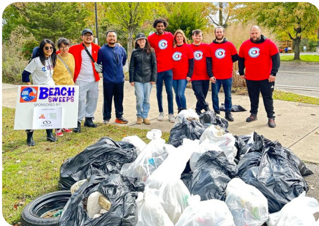
County Sponsor Target at Palmyra Cove