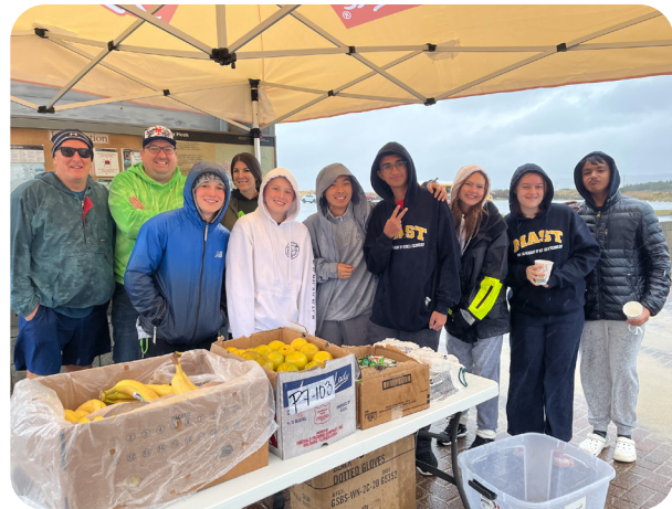
Statewide Sponsor ShopRite/Wakefern with Marine Academy of Science & Technology Students at Sandy Hook