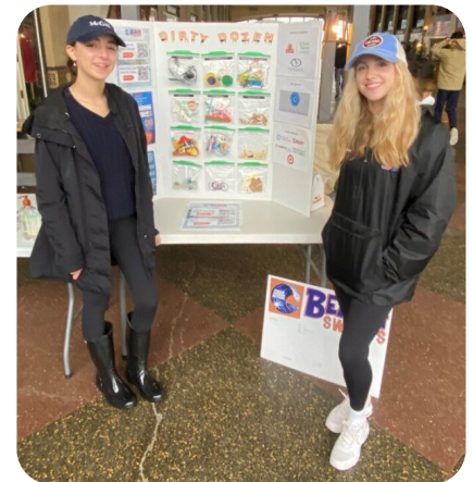
Asbury Park Convention Hall Jr Captains